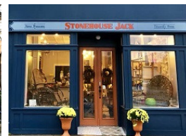
2016 Grant Recipient