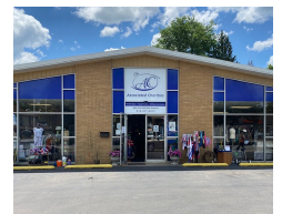
2020 Grant Recipient

The Façade grant is focused on improving existing façades in the downtown business district. The grant program was once funded by all private donations, however these private funds have been decreasing in the past few years. We needed to look at other funding sources. We are so thankful that we were awarded this money and now have $50,000 going into our 9th round in early 2023!